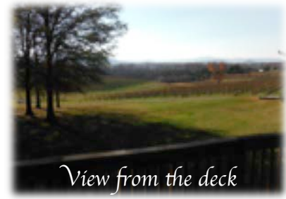
View from the deck

We'd love to host you! For additional information or reservations please call us at 336-352-5595, email us at info@roundpeak.com , or check us out on VRBO.COM , listing 317121