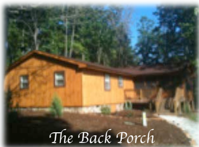
The Back Porch