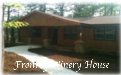
Front of Winery House