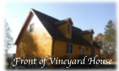
Front of Vineyard House