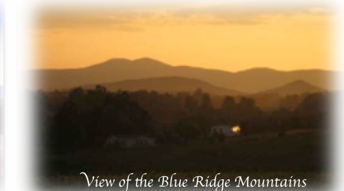
View of the Blue Ridge Mountains

Enjoy a get-away weekend in the heart of North Carolina wine country, sample some great wines and beers, walk the vineyards, and relax with spectacular sunsets over the Blue Ridge Mountains. With 4 bedrooms and 2 full baths, each house comfortably sleeps 8. We are dog-friendly, with a fenced-in play area!