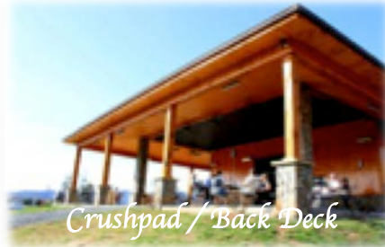
Crushpad / Back Deck