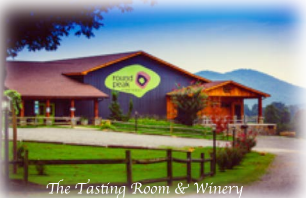
The Tasting Room & Winery