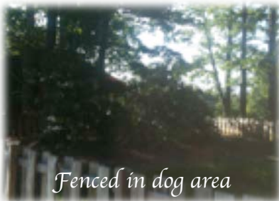
Fenced in dog area