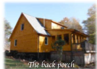
The back porch